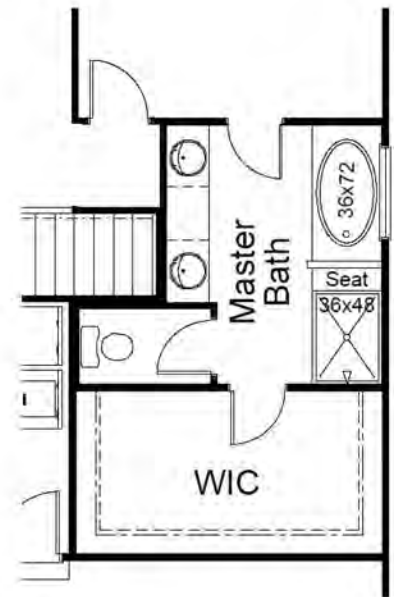
Optional Luxury Master Bath